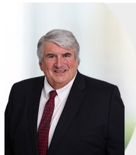
Donald A. Kessler