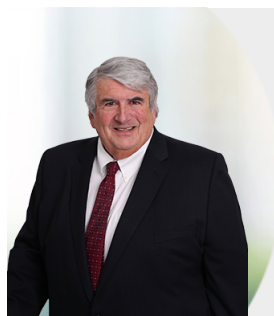
Donald A. Kessler